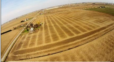
It's easy to see where the tile drainage lines are in this field. This photo captured by a drone enables a farmer to check to see how wet different areas of the field are.