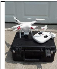
A quad copter UAV from Thumb Drone Works.

Below are copies of the photos that should be printed with this article, along with the appropriate captions. These photos were sent as separate .jpeg files – they are included here so that you can see the photos together with their captions.